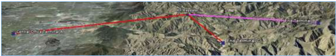
Figure 3 RF-6000E Y-Junction Repeater, 3-Hops

An RF-6000E-99 repeater is used to provide links to two end terminals located in a mountainous region. The repeater site's high elevation provides a vantage point where clear, line-of-sight paths to each microwave terminal exist. A photovoltaic and wind turbine power system operates the repeater at this remote location. Site access is by four wheel drive vehicle.