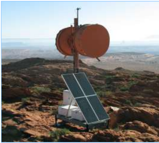
Figure 1 RF-6000E Solar Powered Repeater