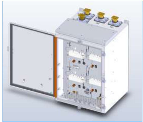
Figure 2 RF-6000E with Weathertight Enclosure