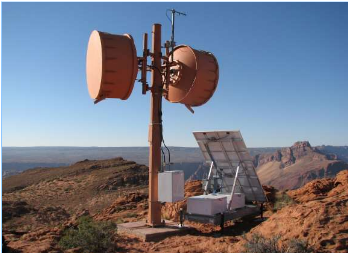
Figure 6 RF Repeater Installation with Solar Power

The path between Terminal A and Terminal B is obstructed by a ridge at the edge of a canyon. An RF-6000EW repeater is located on the ridge where line-of-sight paths to both terminals exist. The repeater site is isolated, requiring four wheel drive vehicles for access. Photovoltaic system provides operating power for the repeater. The repeater site in this example is shown in the figure below.